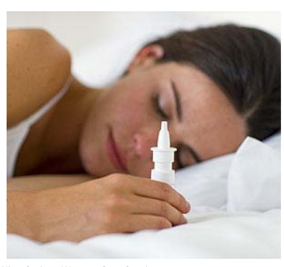
Nine Curious Ways to Stop Snoring