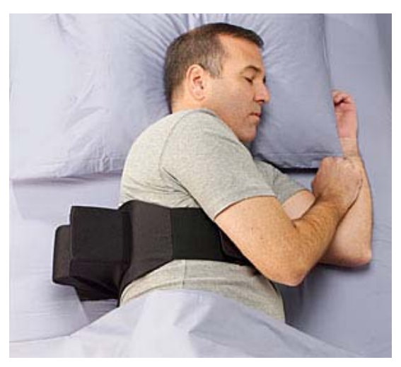
Nine Curious Ways to Stop Snoring

By Laurie Pawlik-Kienlen for MSN Health & Fitness