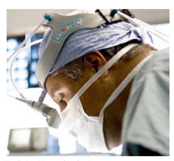
Nine Curious Ways to Stop Snoring