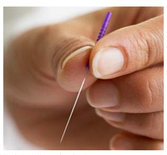
Nine Curious Ways to Stop Snoring