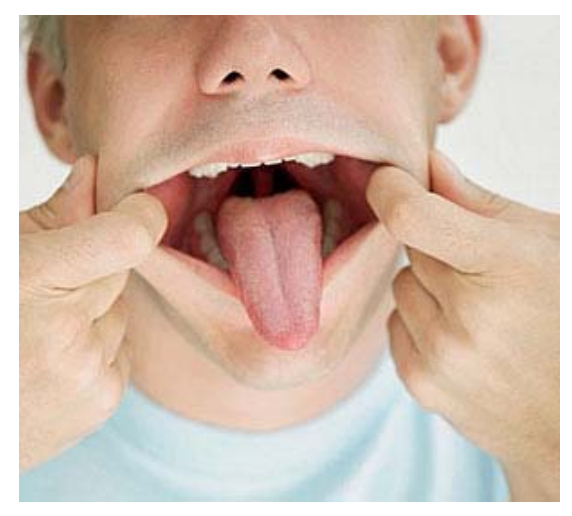
Nine Curious Ways to Stop Snoring