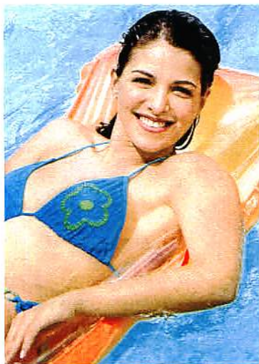
Keeping cool in a pool can help you sidestep summer SAD symptoms.